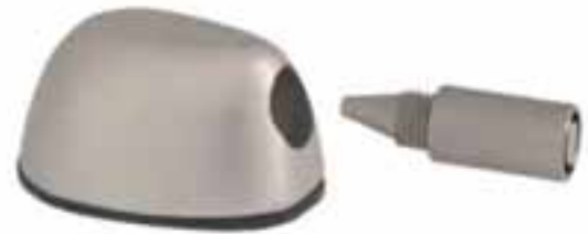
Pedlock Flush Mount style Lockinator Pedestal Lock, 2 prong