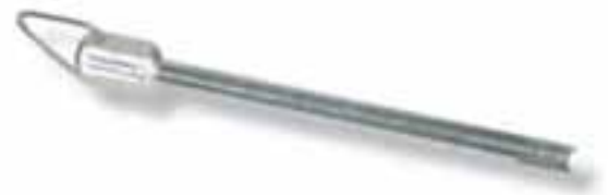
Lockinator Terminator Tool, 2 Prong, Chrome Plated, Individually Serialized, 8" length