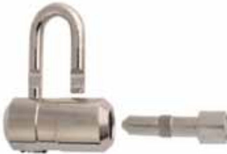
Padlock style Lockinator Pedestal Lock, 2 prong