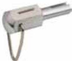
Lockinator Terminator Tool, 2 Prong, Chrome Plated, Individually Serialized, 2" length